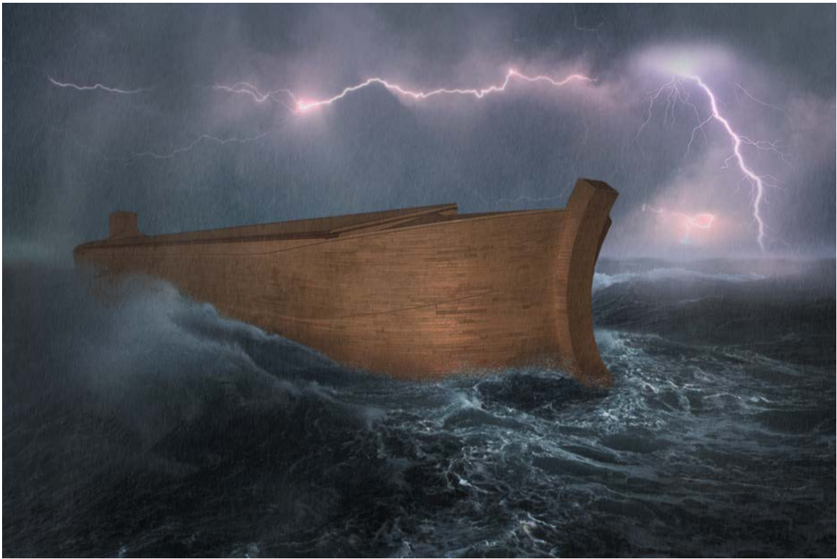
Caption: Struck! The Series. The Ark rises above a world-ending flood, saving Noah's family of eight.